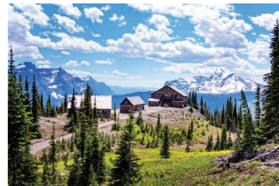
Granite Park Chalet

After the debut and booksigning at the Sportsman Ski Haus on May 8, the book will be available in area book and gift shops and in Glacier National Park shops. You can see more of Bret Bouda's photographs and find out about his other books at www.digitalbroadway.com .