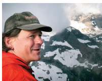
Photographer/Author Bret Bouda